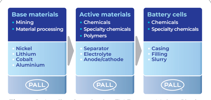
Figure 2: Applications in the EV Battery Value Chain

Pall Corporation is your partner for filtration and separation needs and has experience throughout the EV battery value chain. Pall has over 400 qualified Engineers and Scientists that can provide: prototype testing, on site pilot testing, best practice training, process optimization, audits, contaminant analysis, application troubleshooting, validation services, presentations at scientific forums, and journal publications.