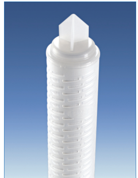
Figure 3: Emflon PFAW cartridges offer exceptionally high flow rates and are used for less critical bioburden reduction in gases.