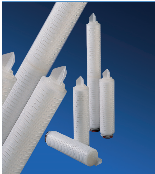
Emflon PFRW Filter Cartridges