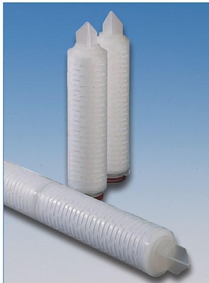
Figure 2: Emflon PFW cartridges are designed for sterilization of large volume gases in compact installations.