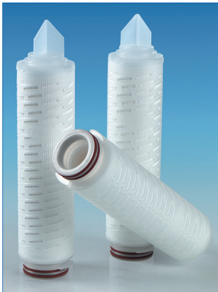
Figure 1: Emflon HTPFRW cartridges provide sterilization of high temperature gases and can be considered for use in oxygen-enriched air applications.

Pall's Emflon filter family offers a variety of solutions for addressing microbial removal in air and gas applications. Please contact Pall for further information.