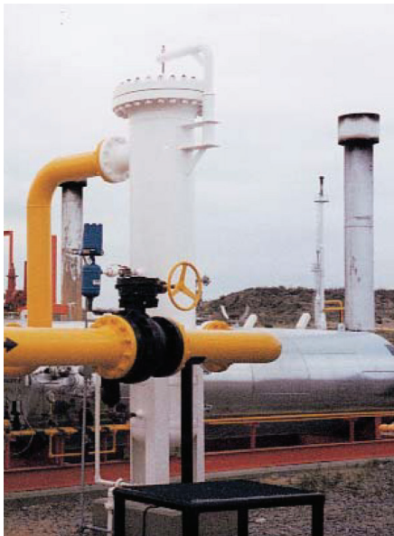
SepraSol liquid/gas coalescer system